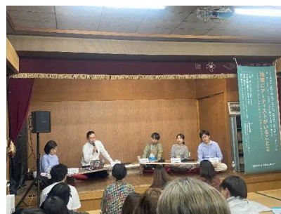
Kashima 2023 Artist-in-Residence Symposium, held at the Beppu Citizen Center